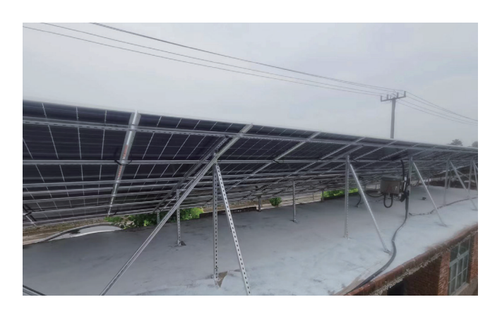
Figure 2. The project picture

In total, 30 pieces of bifacial modules of two different technologies TOPCon and PERC were Installed in two fixed arrays at a tilt angle of 25 °, and each bifacial module contains 144 pieces of the half-cut cell (182" size). Moreover, the height of the supporting system was 0.4 meter. The ground was painted white to acquire accurate results since bifacial modules are sensitive to the surroundings. The PASAN Sun simulator measured the front and rear sides' electrical characteristics. The bifaciality and the low light efficiency at 200W/m² were also measured and calculated. The outdoor energy generation was measured by GCI-36K-5G inverter in a 5-min interval. The energy yield performance of TOPCon, and PERC bifacial PV were revealed and systematically compared.