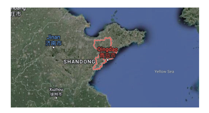
Figure 1.The location information of Qingdao

To investigate and compare the TOPCon panel and PERC panel in outdoor performance, an outdoor field test has been conducted in Qingdao (36°04'N, 120°30'E), China.